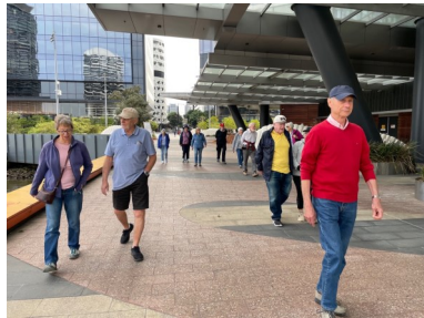
footbridge to Docklands for coffee.